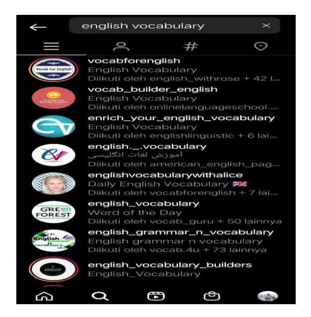
Figure 1. Searching Menu Appearance

2. Enter the main page. In this step, you have to ensure the material especially level and content material. Then, if it fixed enough, click "follow" and dont forget to activing the notifications so you can immediately know if there is a new post.