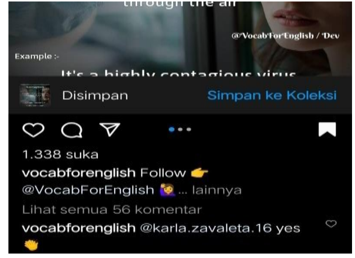
Figure 4. Saving the Material

4. If you do not have enough time to spend, you can save the material to read later. You can click 'save to collection' to save the material. The saved material will hint white and there will appear a sentence said "saved".