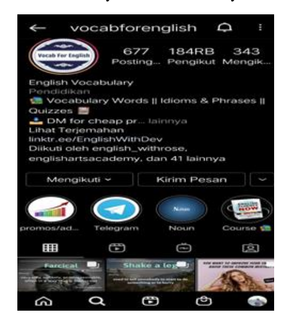
Figure 2. Main Page and Notification Options

2. Enter the main page. In this step, you have to ensure the material especially level and content material. Then, if it fixed enough, click "follow" and dont forget to activing the notifications so you can immediately know if there is a new post.