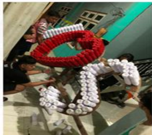
Gambar 5. (a), (b)

organic waste. The participants increasingly understand that waste in the kitchen and other organic waste can actually be used as compost using simple tools that are easy to obtain. The reason is that kitchen waste, which previously was just wasted, has now been given additional insight so that it can be used as compost material which can be useful for fertilizing plants. And if focused, the processed compost product has the opportunity to have economic value so that it can be used as additional income for the community (Astuti & Hariyono, 2018).