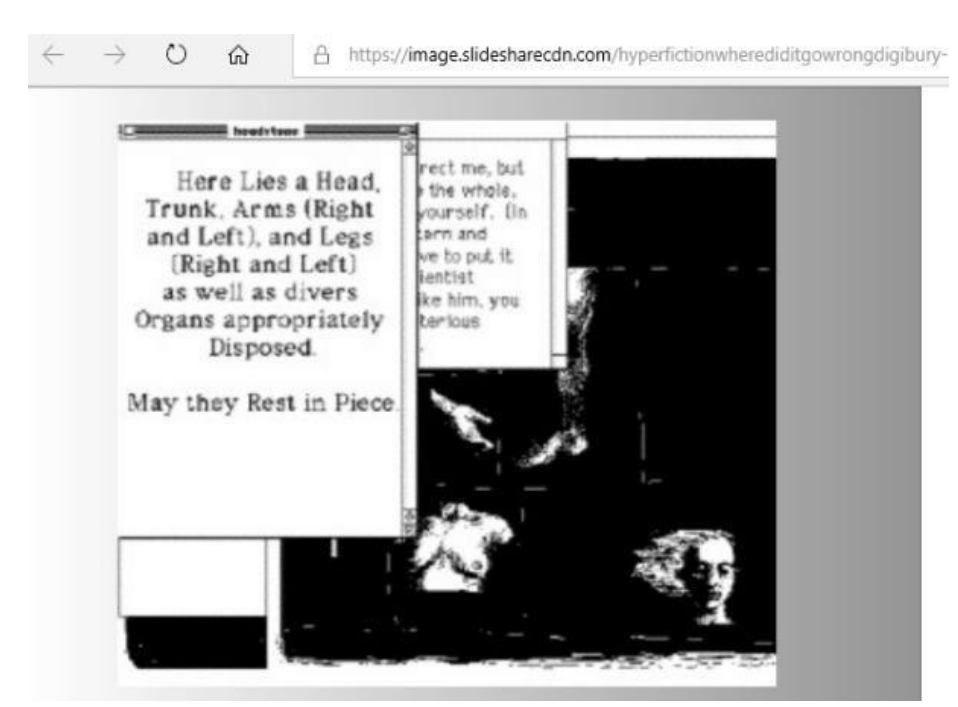
Fig. 3. Patchwork Girl

Authentic electronic prose enables students to be aware of the digital environment of elit. It means that the teacher should not employ fiction/ nonfiction that was originally derived from a printed form, or simply say, should not use e-books. To facilitate the sense of reading engagement, the teacher can employ interactive fiction that the tradition builds from the heritage of text adventures. This interactive prose allows the reader to participate in a story and explore digital space. As illustrated in the opening of this article, this type of e-lit is an enhanced version of Atwood's metafiction. An excellent example is the interactive epistolary novel created by Emily Short (2012) entitled First Draft of the Revolution (the story can be accessed through this link: <u>https://lizadaly.com/first-draft/content/intropage.html</u>). This is free material, so the students can easily access the story.