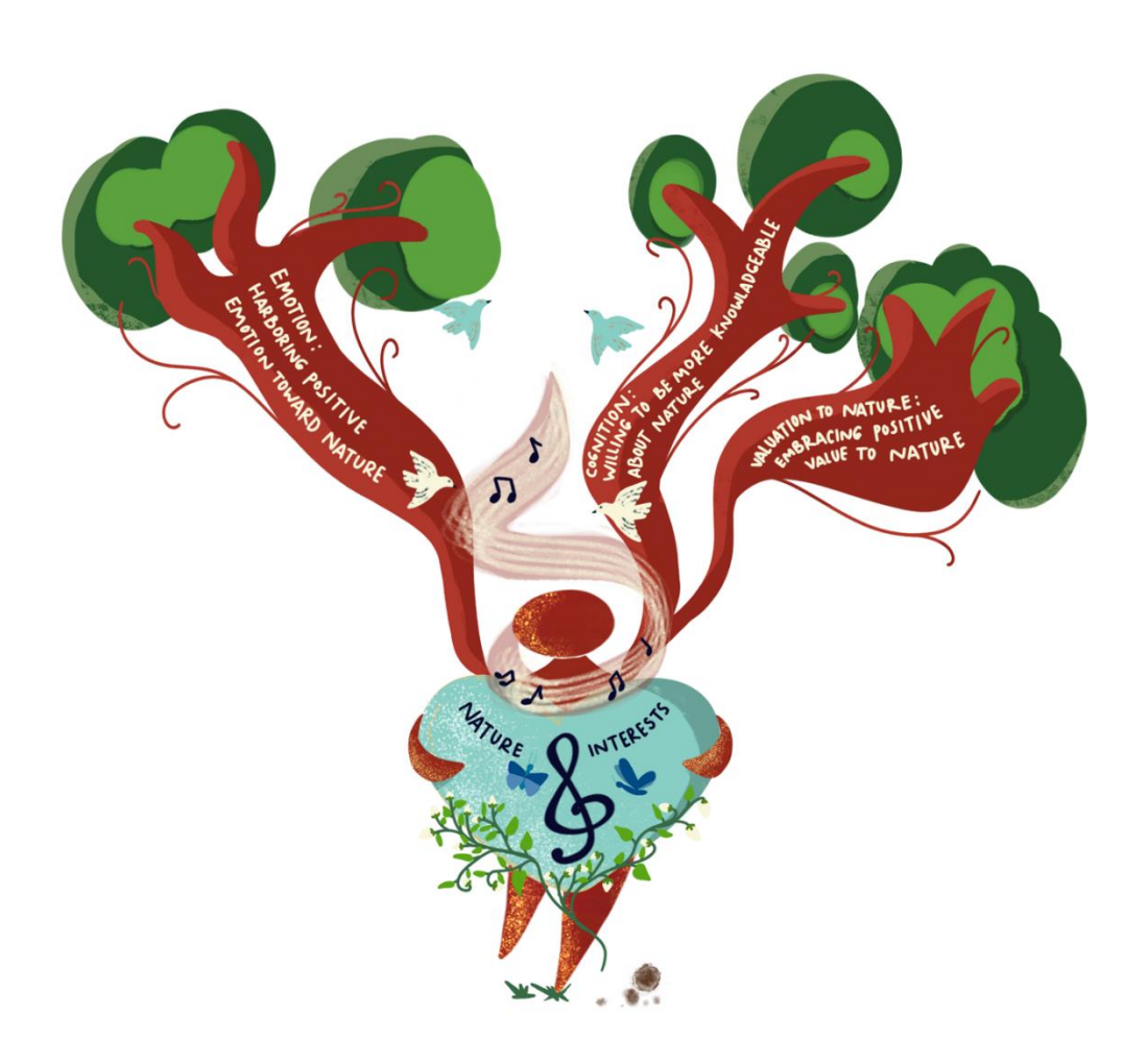
Figure 3 The Students' Interests to Nature in the Ecomusicology Instruction about the Earth

Figure 3 elucidates the development of students' interests in nature in the ecomusicology instruction about the Earth. The treble clef, notes, and bar lines that surround and are held by the human represent the ecomusicology instruction. The plants, rocks, trees, and birds represent the diverse entities in nature. The love symbolizes the strong interests in nature, elaborated in the branches of the tree. The elaborations were derived from the combination of quantitative results outlined in the questionnaire items and the qualitative findings from the open-ended questionnaires. Thus, following their participation in the ecomusicology instruction about the Earth, students harbored positive emotions to nature and posed a willingness to be more knowledgeable about nature. Additionally, students posed positive valuation to nature, as reflected in the items of questionnaire in the valuation domain, suggesting a favorable worldview regarding their engagements with nature as humans.