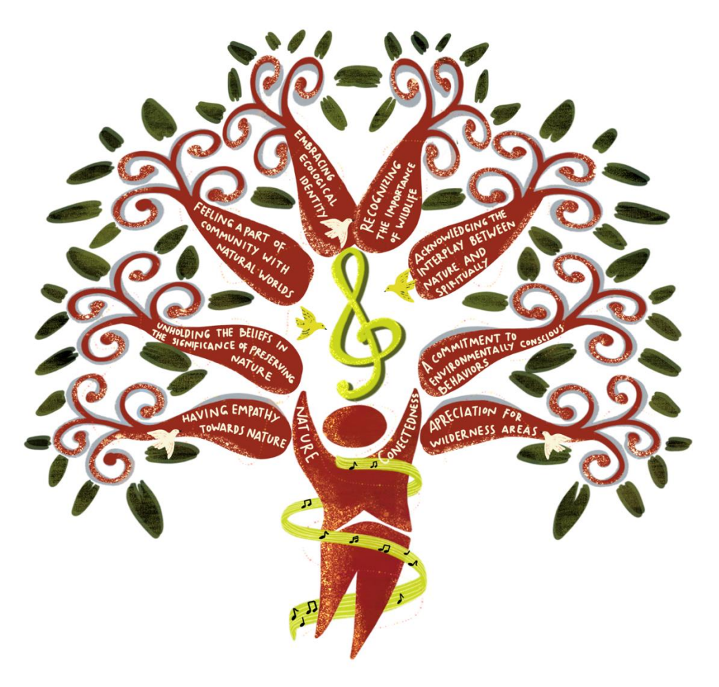
Figure 2 The Students' Nature Connectedness in the Ecomusicology Instruction about the Earth

Figure 2 illustrates the development of students' nature connectedness in the ecomusicology instruction about the Earth. The treble clef, notes, and bar lines that surround and are held by the human tree represent the ecomusicology instruction. The human tree him/herself symbolizes the heightened senses of oneness with nature, elaborated in the branches of the tree. The elaborations were derived from the