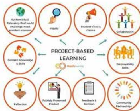
Figure 1, Project Based Learning

In Figure 1, the implementation of project-based learning cannot be fully realized in online learning. Learning in the future Covid 19 certainly requires adjustments in the implementation of project-based learning, due to the application of the Minister of Education and Culture No. 4 of 2020 makes teachers and students can not meet directly to lead the learning process. Project-based learning is generally done in groups or in collaboration with students, but during a pandemic, collaboration can be established between students and parents to involve teachers, students and parents. The implementation of project-based learning during the Covid 19 pandemic was achieved by choosing the right media because learning was not done face-to-face but was carried out using distance learning methods. Implementation of learning at home namely distance learning emphasizes the concept of learning by using means that allow interaction between teachers and students, not creating new costs because the learning conditions that occur are not normal conditions.