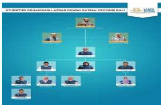
Image of the LAZNAS Structure of the Denpasar City Da'wah Council